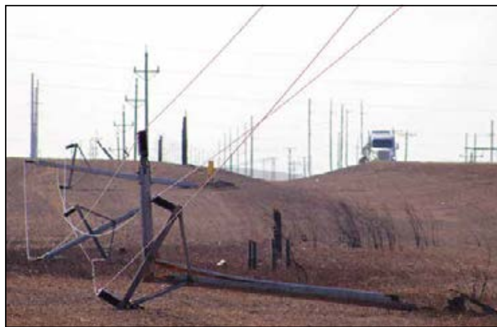
A burned power pole sits off 109th Avenue, between Ray and Tioga, N.D., after fires came through the area on Oct. 5, 2024.

People affected by wildfires can find financial, mental and physical recovery resources at ndresponse.gov/wildfire-recovery .