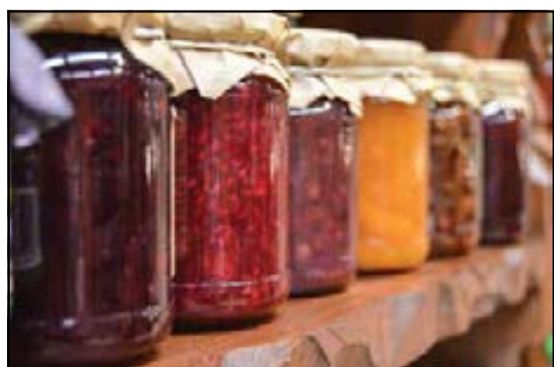
This free series is designed to answer questions from food entrepreneurs about food safety.

This free series is designed to answer questions from food entrepreneurs about food safety. Each webinar is from 11 a.m. to noon. "Through the power and popularity of social media