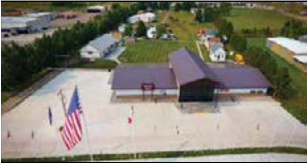
McKenzie County Heritage Park. (Photo submitted)

Let's join together as a community and discover the secret to wintering well as we reconnect with the old-fashioned life!