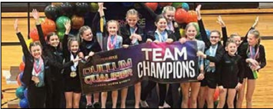
Sidney gymnasts team took first place in the Silver division at the Dullum Qualifier in Dickinson.