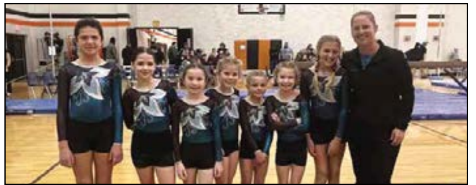
Dullum Qualifier Bronze Team first place winners. (Photos submitted)