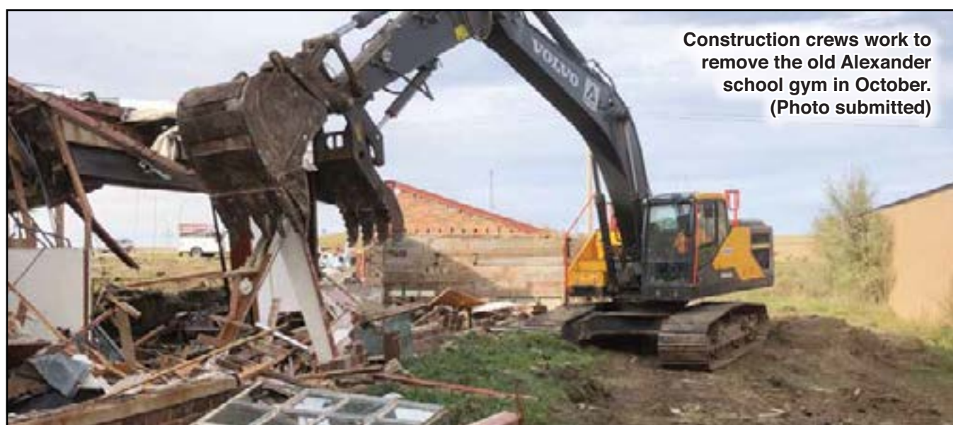
Construction crews work to remove the old Alexander school gym in October.

Alexander's Lewis And Clark Trail Museum Plans To Introduce An Agricultural Education Area To The Museum Grounds